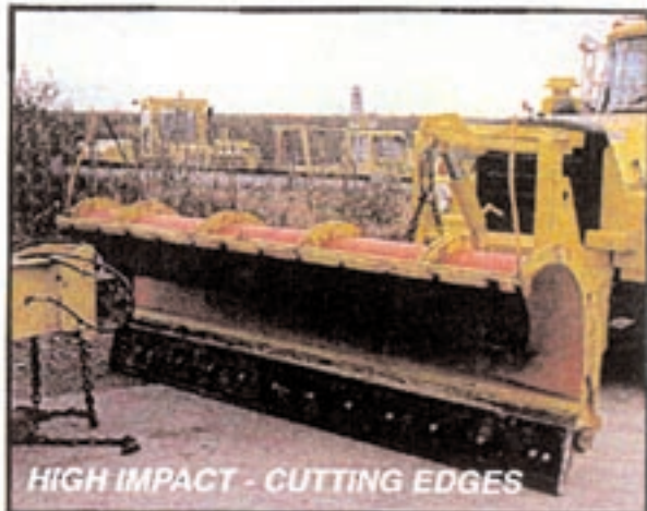
HIGH IMPACT - CUTTING EDGES

Low coefficient of friction, less chatter