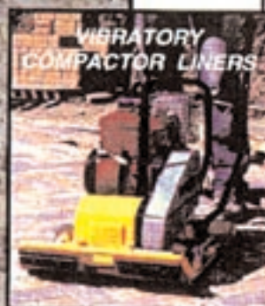
VIBRATORY COMPACTOR LINERS

Low coefficient of friction, less chatter