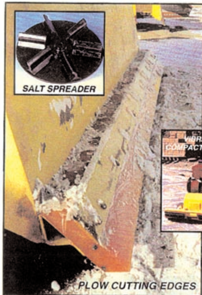
PLOW CUTTING EDGES

High abrasion and impacts in higher operation temperatures